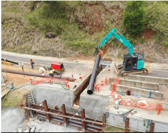
Slip 8 – 60% complete