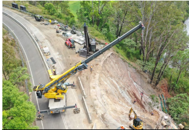
Dewers slip – 60% complete