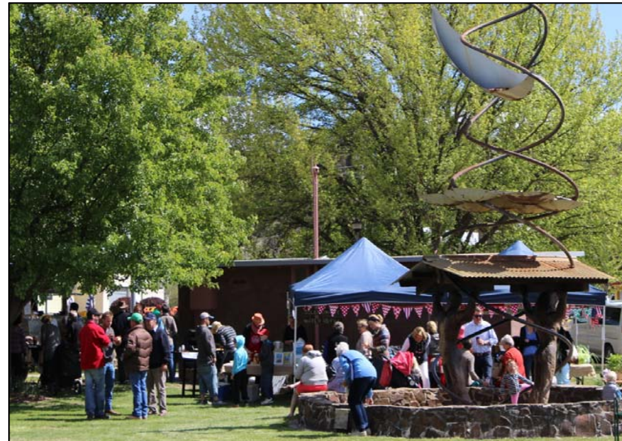
Walcha Farmers Market at McHattan Park