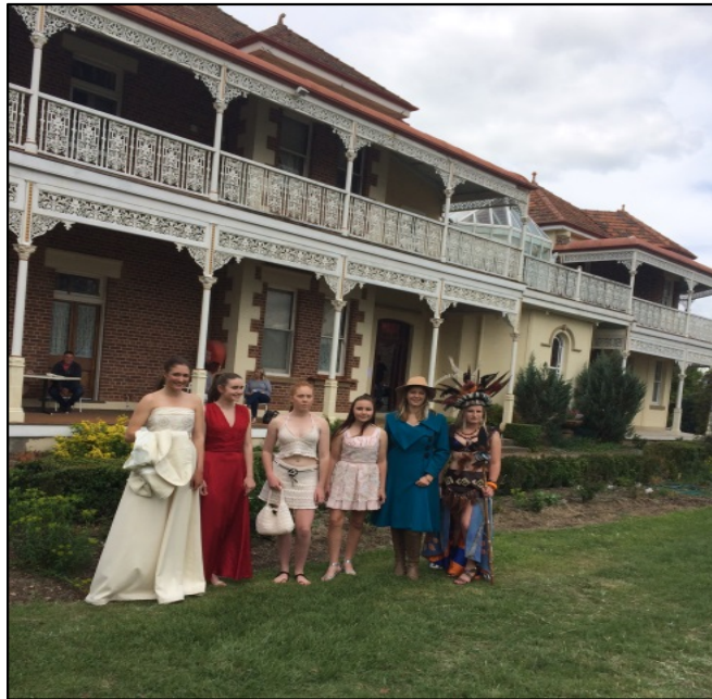
Walcha Mountain Festival at "Langford", Walcha