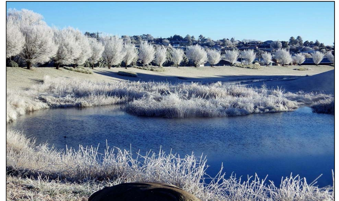
A bit frosty Apsley River in the middle of town