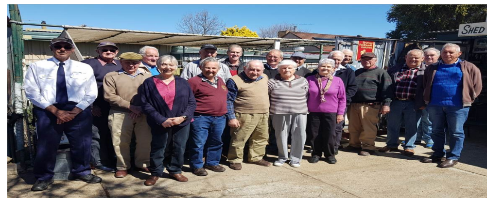
Walcha Council Community Care Mens Group Outing