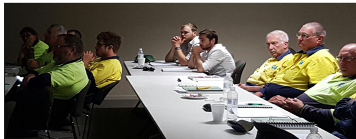
Walcha Council Staff in Training

Responsible Officer Legend: GM = General Manager ESM = Environmental Services Manager DES = Director - Engineering Services CSM = Community Services Manager HRM = Human Resources Manager SMWWS = Snr Manager Water, Sewer & Waste