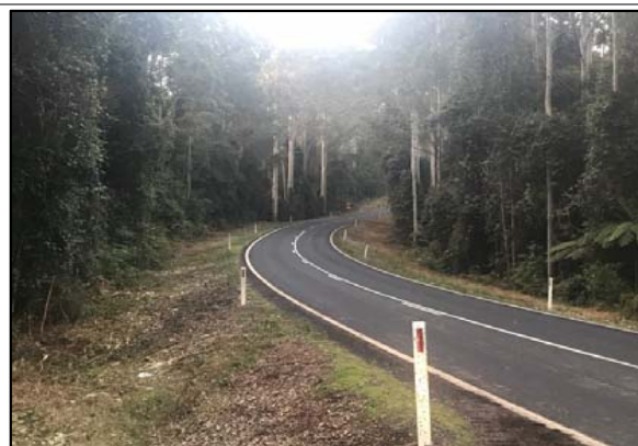
Oxley Highway weed spraying and mulching program.